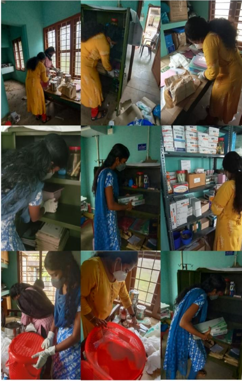
15/04/2021 Palippuram Health center Palliative room cleaning